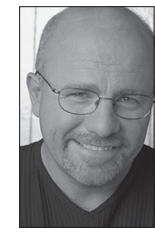
Dave Ramsey Bestselling author

I recommend starting to put money aside, and including it in your budget as soon as you know the need for an item is a real possibility. Waiting until things go wrong or something breaks down will leave you in a real mess, more times than not.